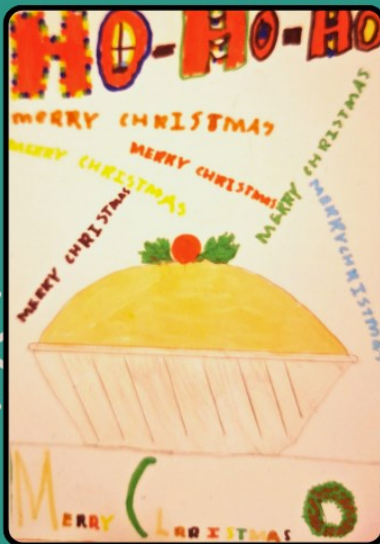
Ocky - Otters