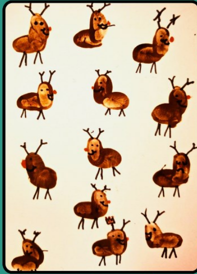
Ayana - Butterflies