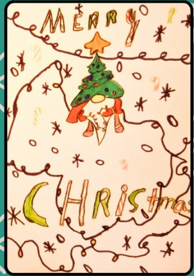
Ophelia - Hedgehogs