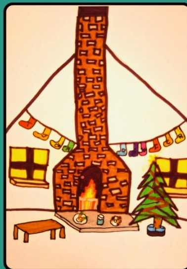
Flossie - Otters