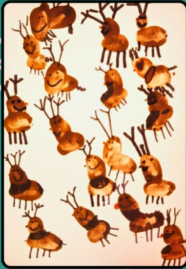
Ella - Butterflies