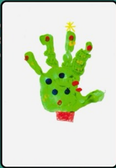
Jesse - Bees Class