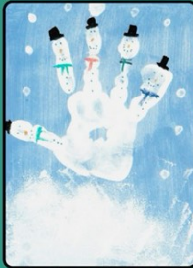
Ridvika - Butterflies