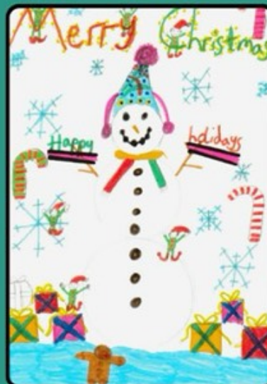
Evelyn - Rabbits