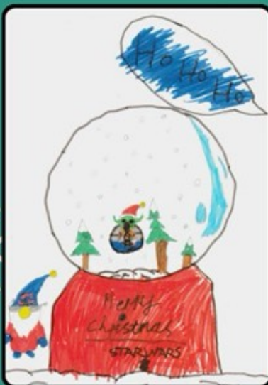
Griff - Hedgehogs