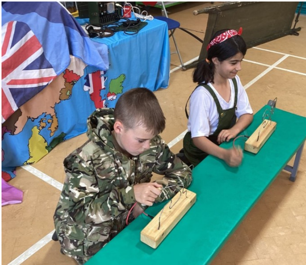
Bomb Disposal Champions Final