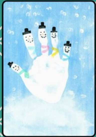
Esmae - Butterflies