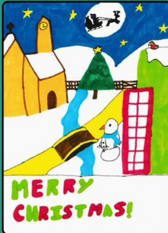
Orla - Otters & Overall winner