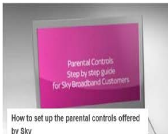
How to set up the parental controls offered by Sky