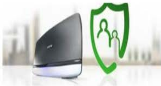
How to set up the parental controls offered by BT