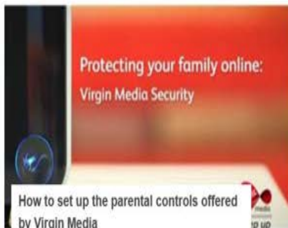
How to set up the parental controls offered by Virgin Media