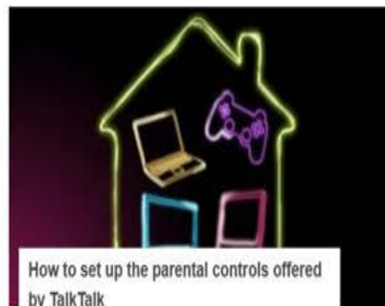
How to set up the parental controls offered by TalkTalk