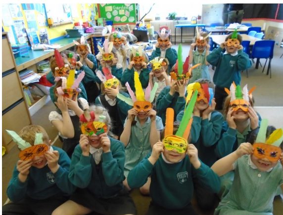
Butterfly class making tribal masks to finish off our rainforest topic.

Bella "We were able to sign the spring songs that we had learning and show them the actions. We were able to show them our learning." Michael