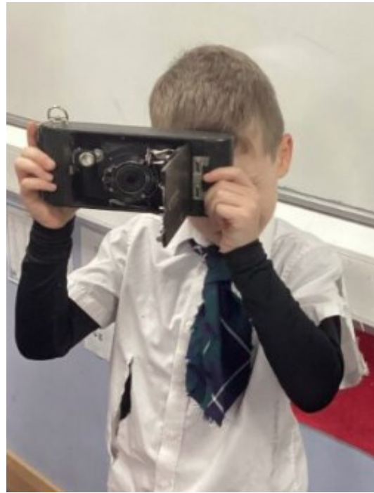
Using an old camera