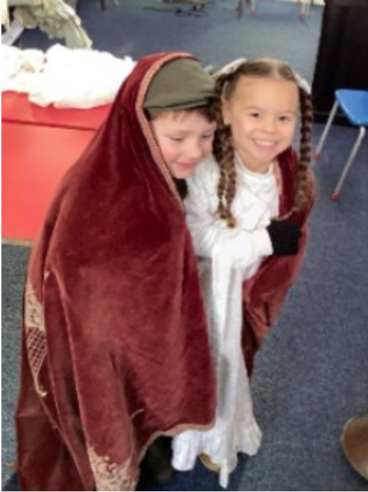
Dressing up in washday costumes