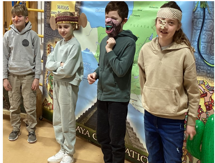
Left to right: False nose, Corn on the Cob head maker, Jade teeth, Cross eyes!

'I wore the headdress because I won the Maya Pok-a-Tok game which is a game that the Maya people played. They had to use their head, knees and hips to keep the ball off the ground. Each feather in my headdress was from the endangered Quetzal bird and could be traded for 2 slaves!'