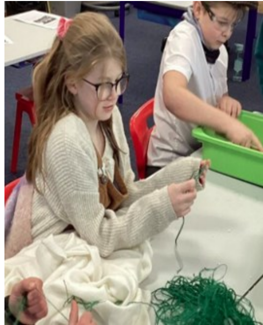
Workhouse jobs: Unravelling rope and crushing rocks